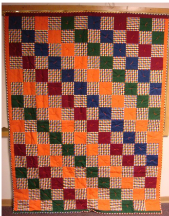
Quilt made by Menno Women In Mission

New this year will be the “ Children’s Auction ”. Kids six grade and younger, with an accompanying adult (parent or grandparent), will have their own auction at 11:15. Auction items will be geared for kids.