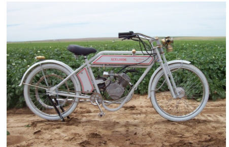
1910 Board Track Racer—raffle