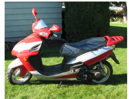
New 2008 Meido Scooter to be auctioned

Serve, share, eat, bid, spend – enjoy the full experience of this year’s Mennonite Country Auction and Relief sale. Websites for more information: